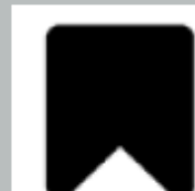
PR & Customer Service