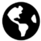
Sales & Marketing