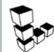
Purchases & Stores