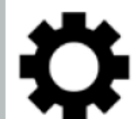
Engineering, Oil and Gas