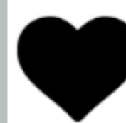
Health, Safety & Security