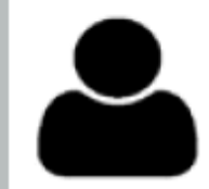
Leadership & Strategic