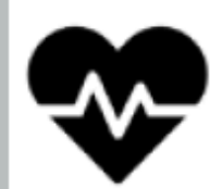
Health Services and Insurance

are customised to sharpen skills across various domains, empowering workers to excel and grow in their careers.